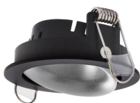
Nok1 Round Trim Tilt CC