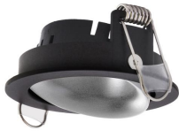
Nok1 Round Trim Tilt CC