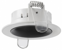
Nok1 Round Trim Fix CC