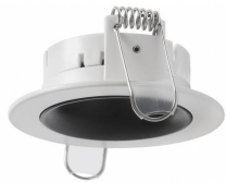
Nok1 Round Trim Fix CC