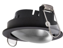
Nok1 Round Trim Tilt CC