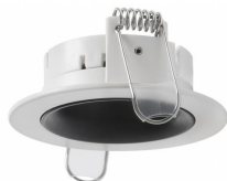
Nok1 Round Trim Fix CC