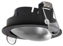
Nok1 Round Trim Tilt CC